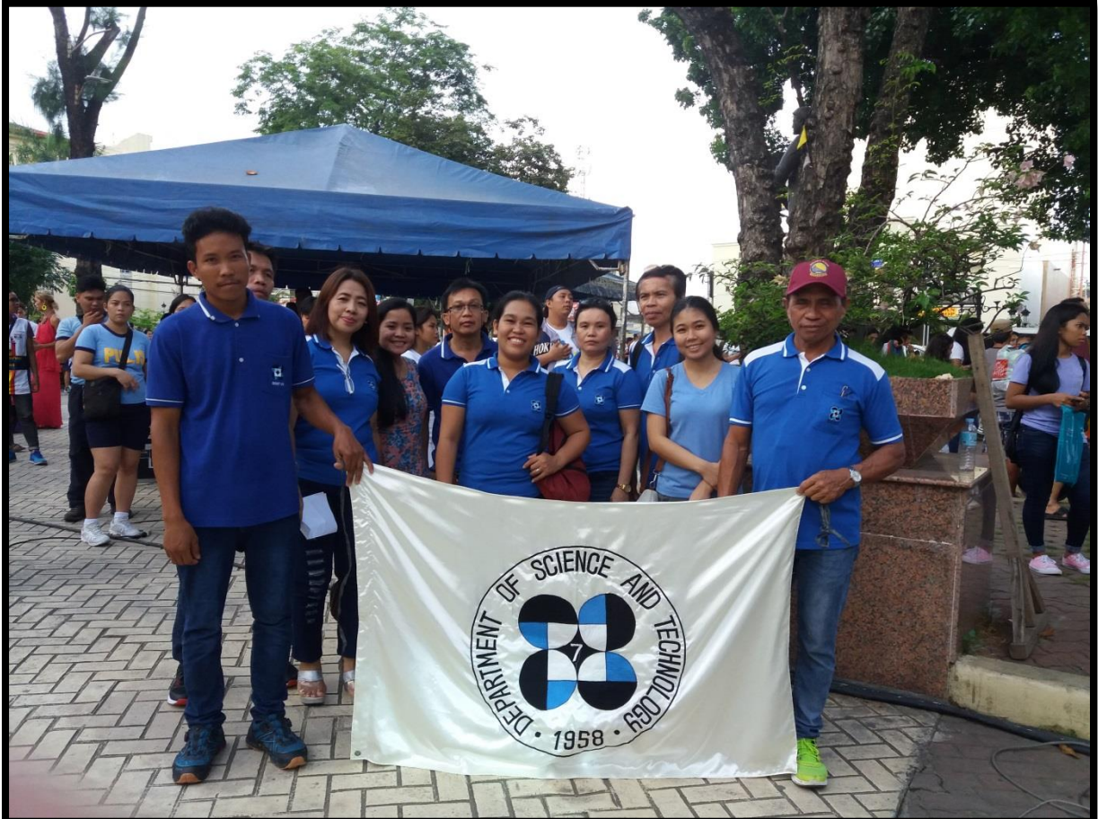
The DOST 7 staff actively participated in the Pride Parade on June 23, 2018 at Fuente Osmeña to Plaza Sugbo in Cebu City.

To help end gender-based discrimination and show support for the passage of the anti-discrimination bill that prohibits discriminatory practices, the Department of Science and Technology Regional Office No. VII (DOST 7) participated in the Cebu City Pride Parade on June 23, 2018 from Fuente Osmeña to Plaza Sugbo Cebu City Hall, Cebu City.